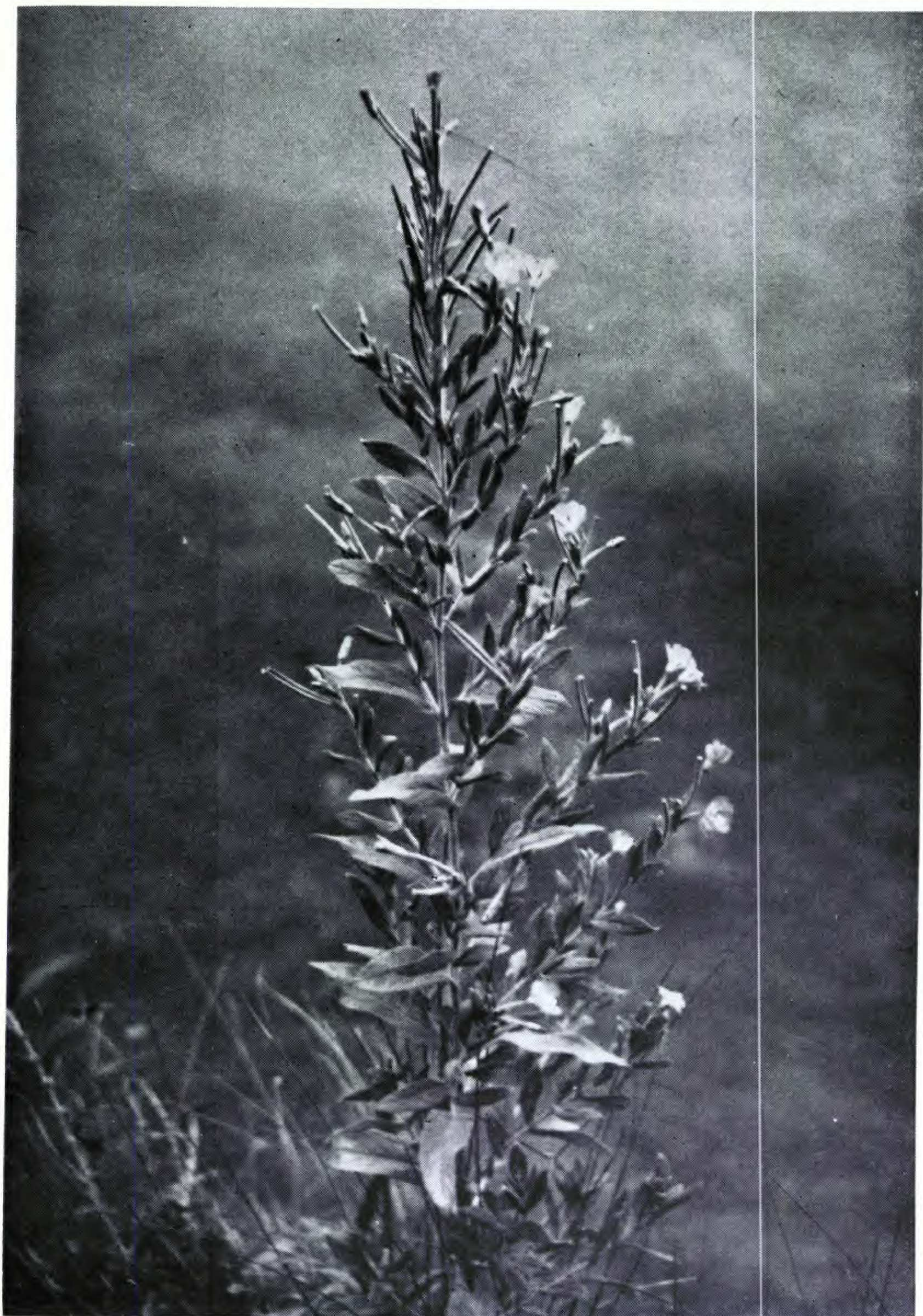
Fig. 1. Epilobium hirsutum (Great hairy willow-herb) from along the banks at edge of an artificial pond at The Maples, North Central Branch of the Ohio Agricultural Research and Development Center, SE side of Sandusky Bay, NW corner of Erie County, Ohio, ca. 4 mi. NW of Castalia, 10 Aug 1968, Stuckey 7327, OS.